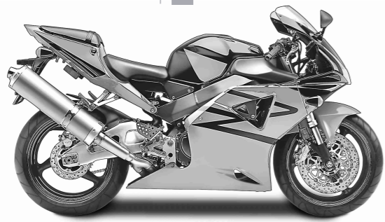
Get In The Know: Theft protection tips.