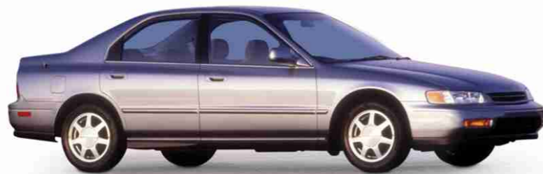
Get In The Know: Theft protection tips.