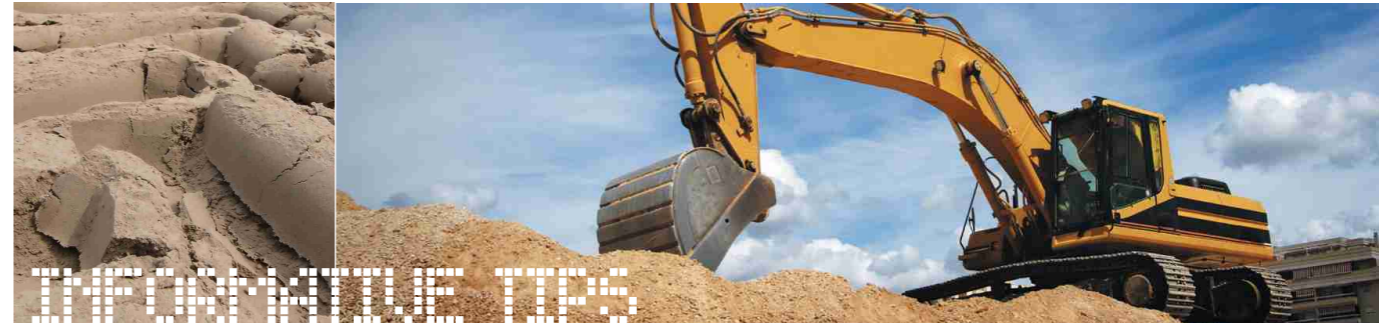
Get In The Know: Theft protection tips.